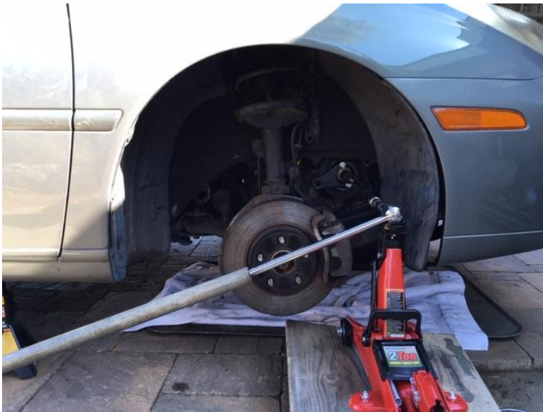
Used the jack to hold setup level