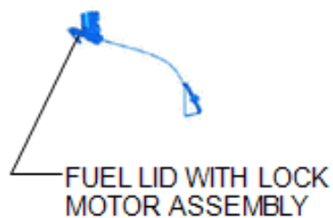
FUEL LID WITH LOCK MOTOR ASSEMBLY