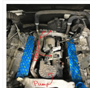
GX470/LX470 check engine