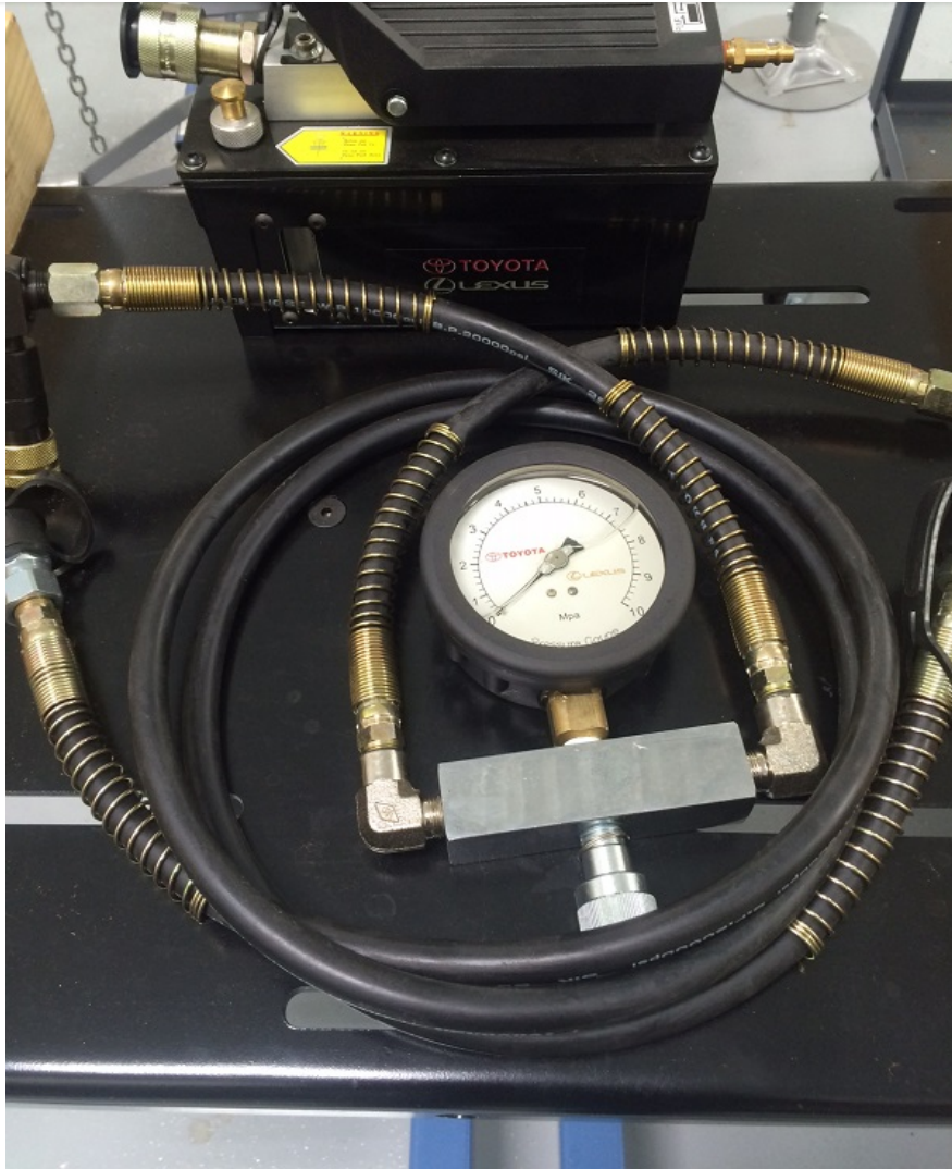
KDSS Service Tool

The most common symptoms of KDSS failure is a severely uneven ride height side to side and/or a flashing KDSS light. The vehicle will also sway more than normal during a turn. Fluid leaks from the cylinder aren't uncommon as well.