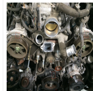
Toyota and Lexus 4.7L V8 2UZ-FE