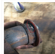
Toyota Sequoia, Tundra, 4Runner