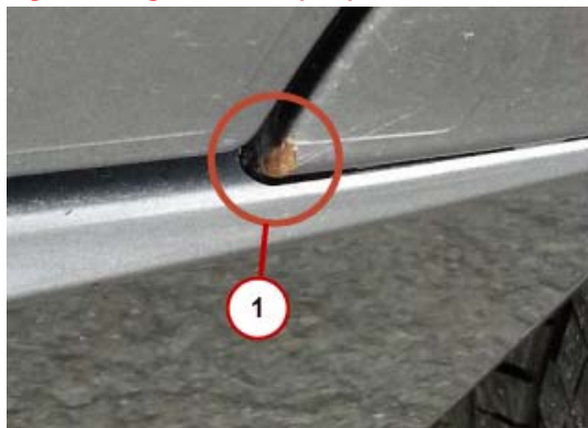
1 Original tape position is seated higher on the dog leg