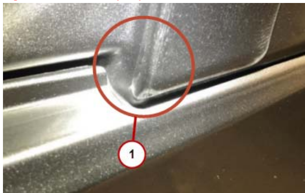
1 New tape position covers previous paint chip. It is seated lower on the dog leg.