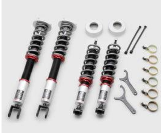
TOM'S Racing Coilover Suspension Kit

https://www.tomsracing.co.jp/sv/products/car/typedetailseng.php?carID=1243&typeID=2431