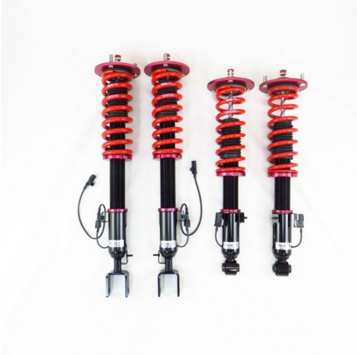
RS-R Best-i Active Coilovers

https://www.rs-r.com/product/lexus-lc500-2018-besti-active