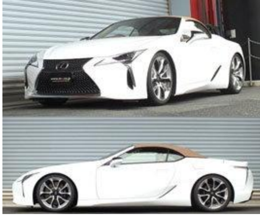
RS-R Best-i Active Coilovers