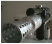
Han Solo's DL-44 Blaster by Bwilson Props