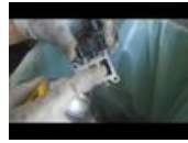
Tutorial: Clean your IAC Valve on a 2005 Acura RSX (video) by nukem384