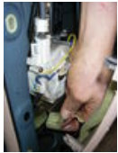
Disable an Automatic Seatbelt with Kung Fu by TimAnderson