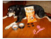
Dog Seat Belt by Coreenis