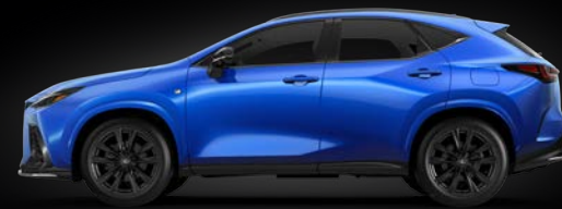
ULTRASONIC BLUE MICA 2.0*