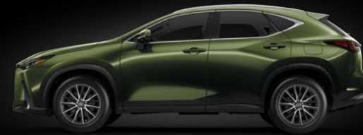
NORI GREEN PEARL