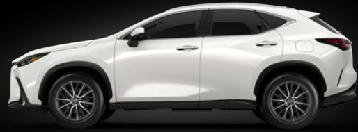
EMINENT WHITE PEARL*