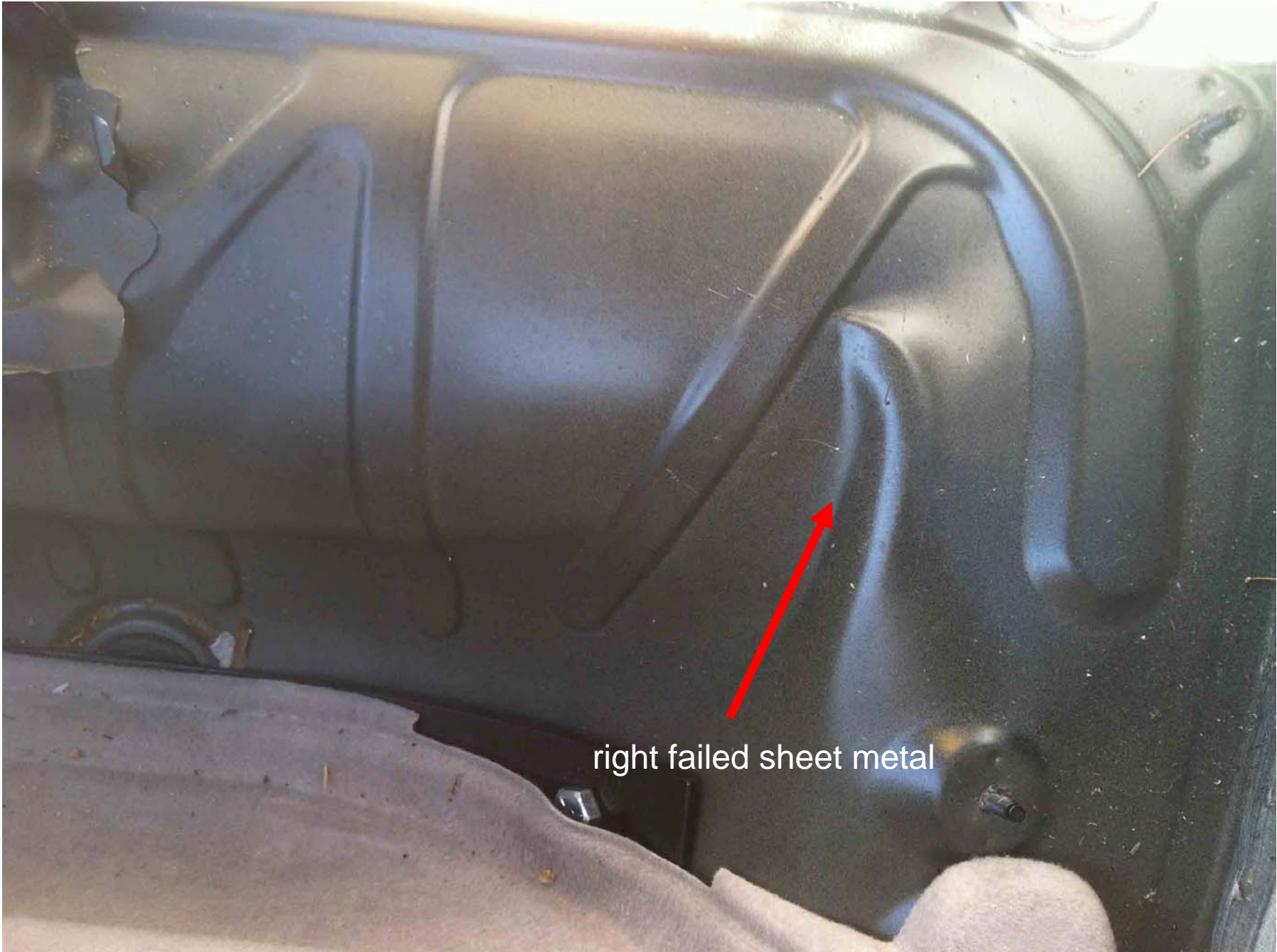
right failed sheet metal