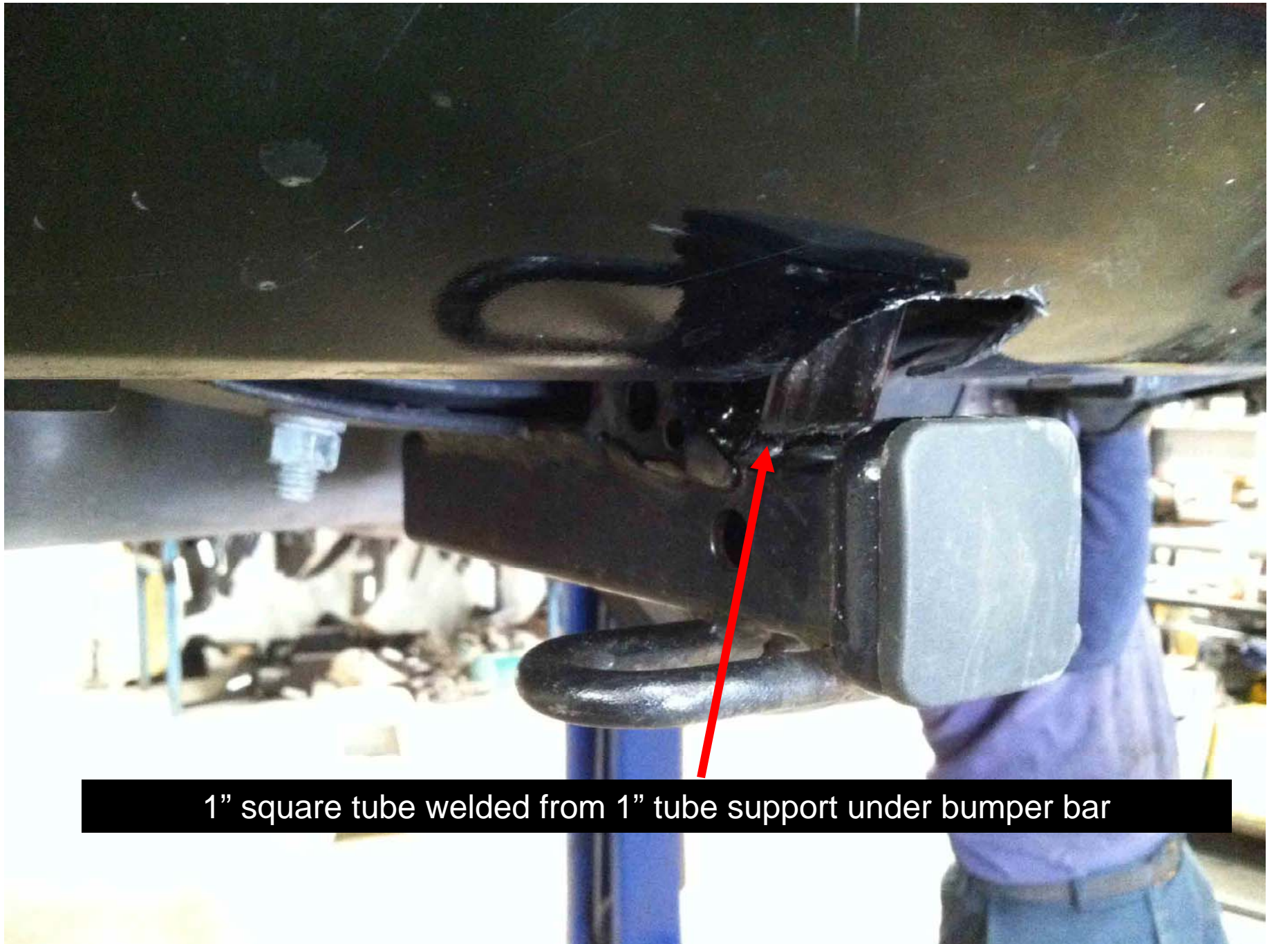
1" square tube welded from 1" tube support under bumper bar