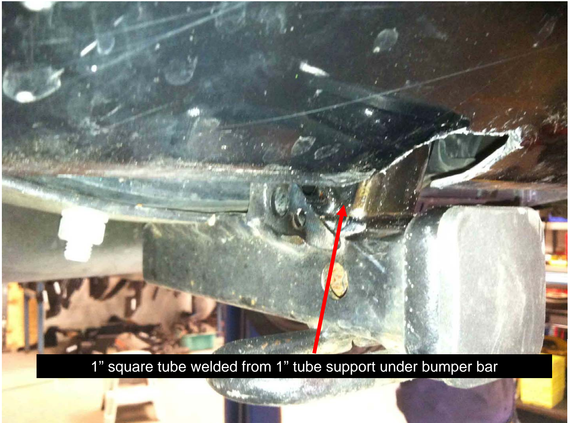
1" square tube welded from 1" tube support under bumper bar