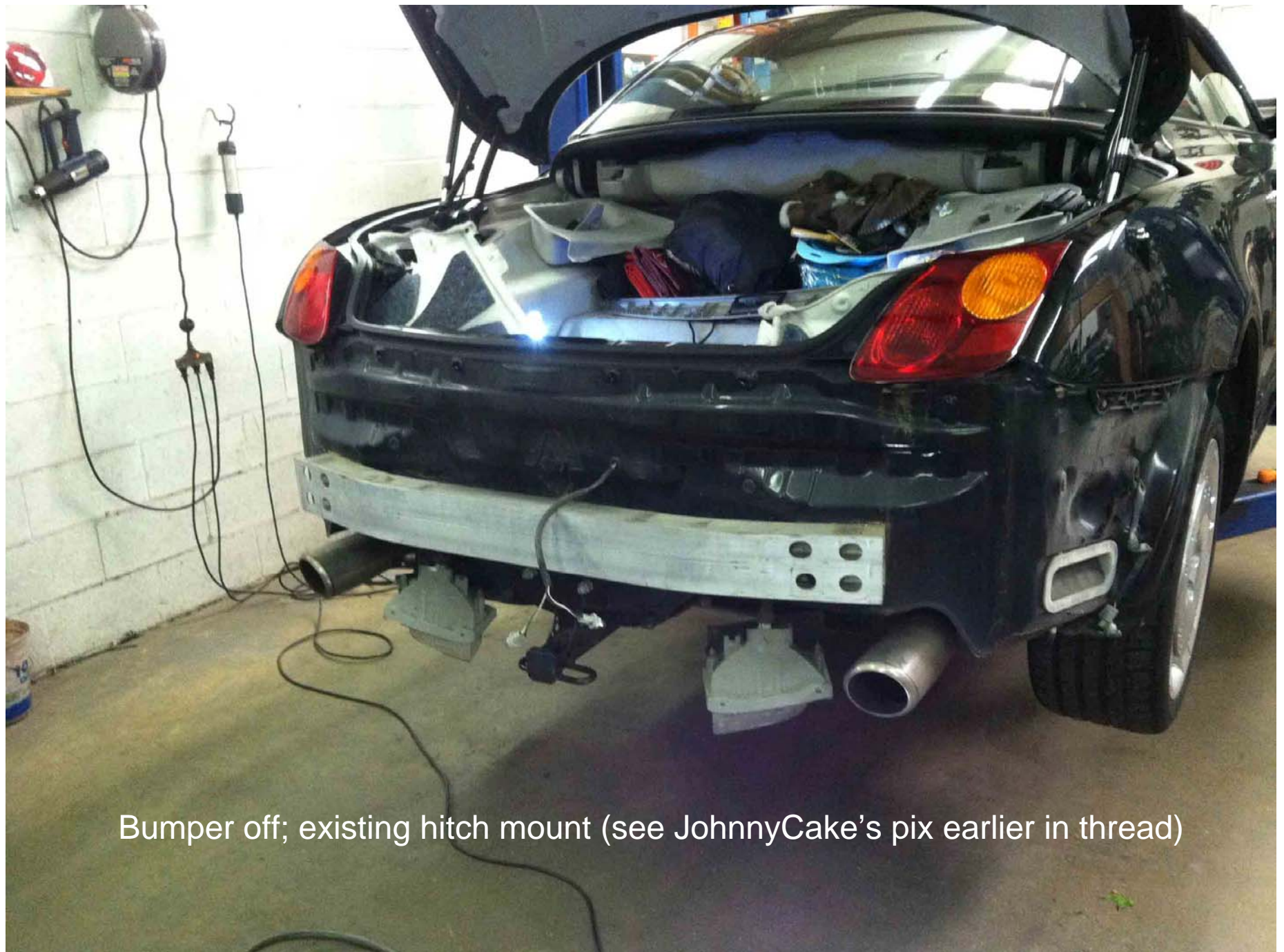
Bumper off; existing hitch mount (see JohnnyCake's pix earlier in thread)