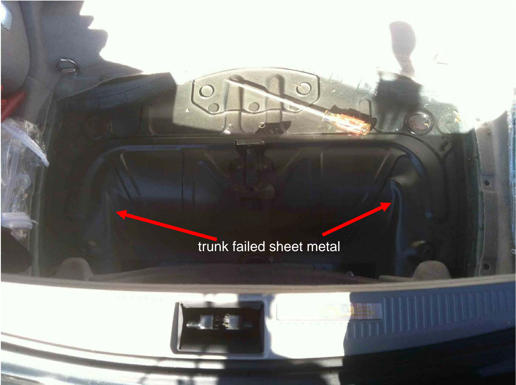
trunk failed sheet metal